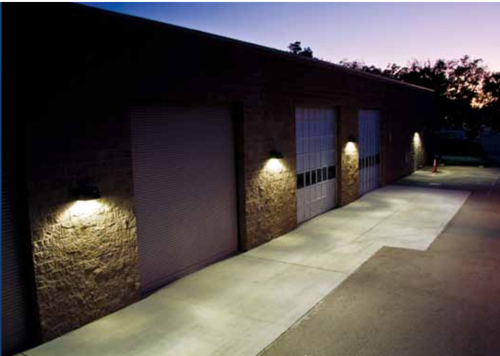
Post-retrofit network-controlled LED wall packs line the Thermal Energy Storage building at UC Davis